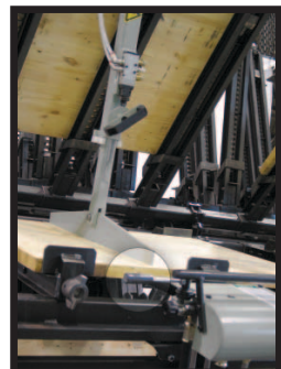
CLAMP TIGHTENER AND PANEL FLATTENER