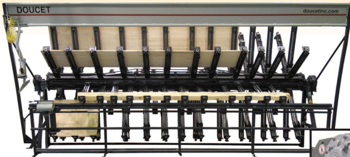
6 SECTION MODEL, 16 1/2' CAPACITY

SRX Clamp Carriers include an hydraulic power unit for quick rotation and perfectly calibrated tightening, a pneumatically activated panel flattener and a pneumatically actuated front rest. SRX Clamp Carriers feature Heavy Duty Doucet Clamps, the heaviest and sturdiest in the industry.