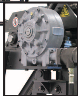
SRX ROTATION MOTOR