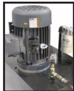
SRX POWER UNIT