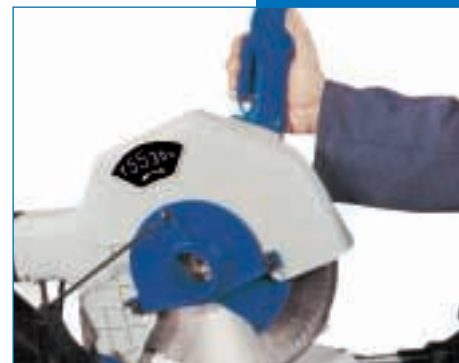
(not available for MEC 300 ST, T50-350, T53-370)