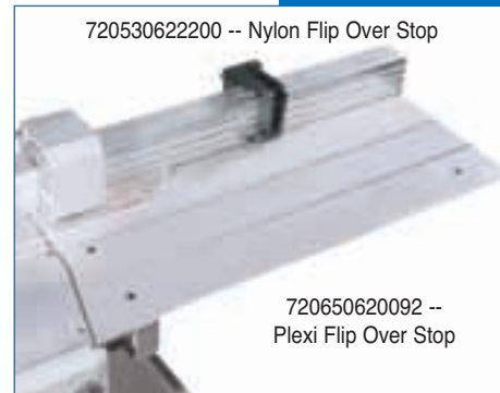
720650620092 -- Plexi Flip Over Stop