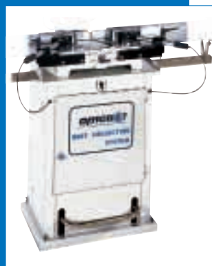
Foot Clamps 720920620097