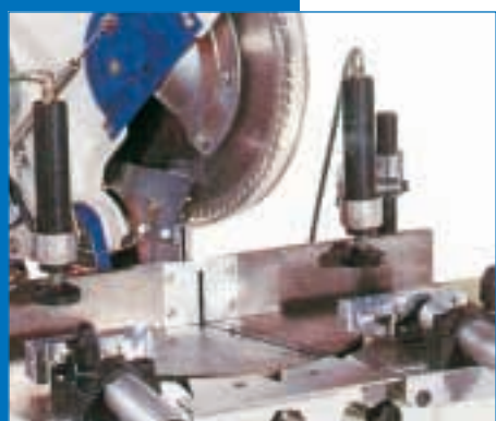
Pneumatic Vertical Clamp 720810510000 only for (T50-350, T53-370)