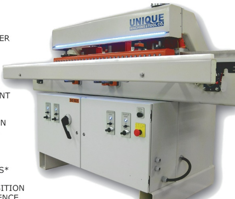
412 adjustable shaper Y-Z shown